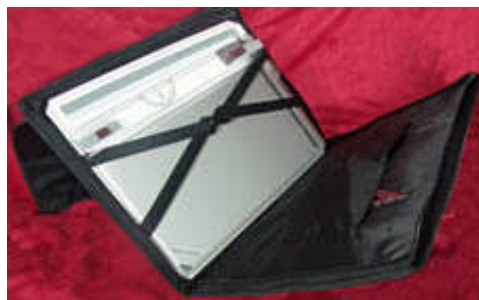
150102 Sling Carry Bag £14.99 + P&P